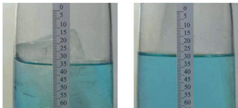
Figure 3. Composite of initial and final state photographs. (left-hand panel) pre-melting and (right-hand panel) melted.